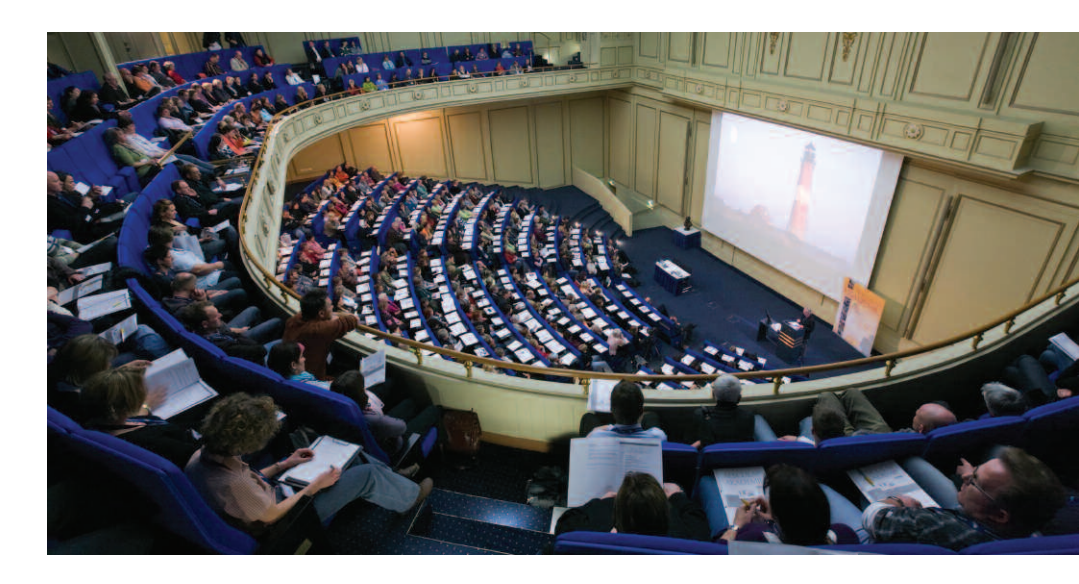
Langenbeck-Vichow-Haus, Berlin, Germany